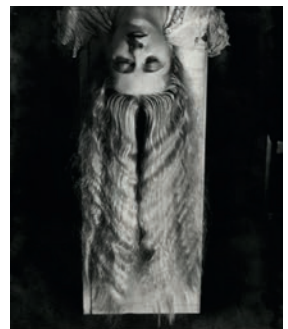
Man Ray, Woman with Long Hair, 1930