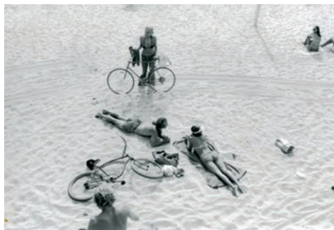
Tod Papageorge, California Beach , from the series At the Beach , 1978, © Tod Papageorge, courtesy Galerie Thomas Zander, Cologne